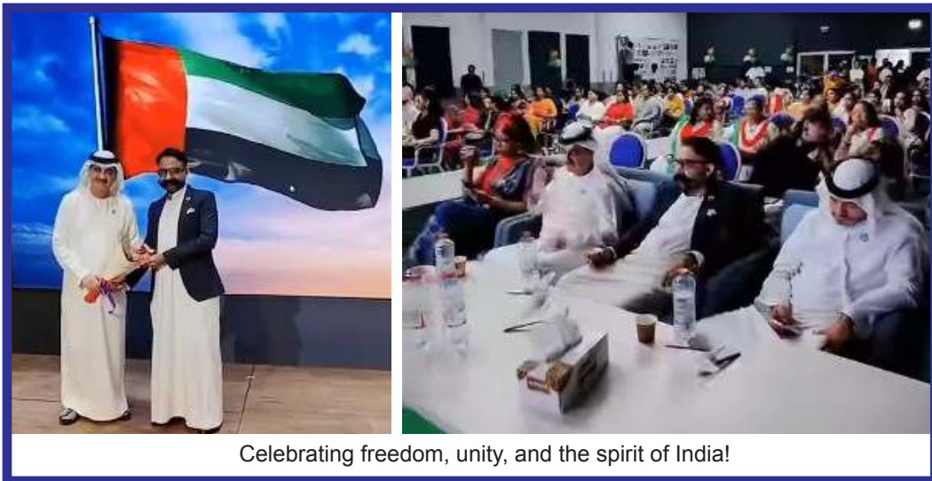
Celebrating freedom, unity, and the spirit of India!