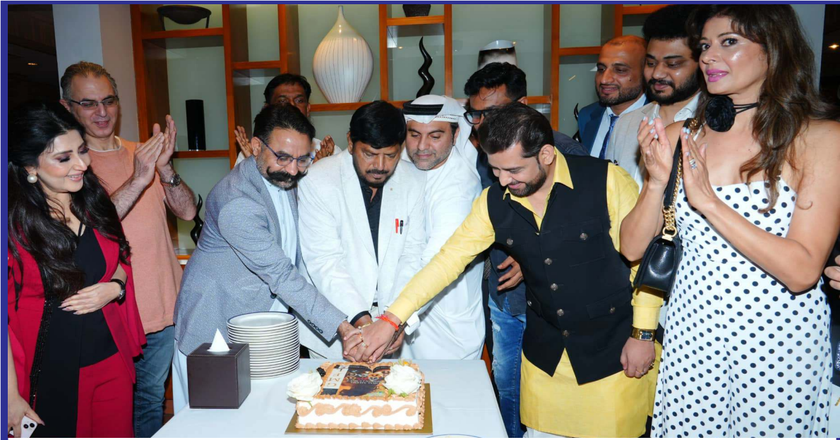
Global Media Fashion League / Show in Dubai World Trade Centre Dubai